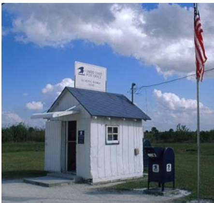
Smallest Post Office in the U.S.: Ochopee, FL 34141