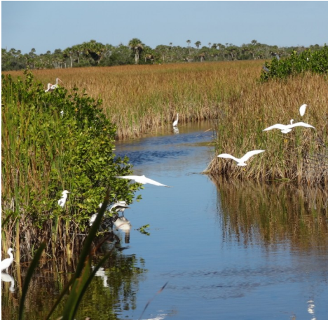
Egrets and Wood Storks near mile-marker 60.