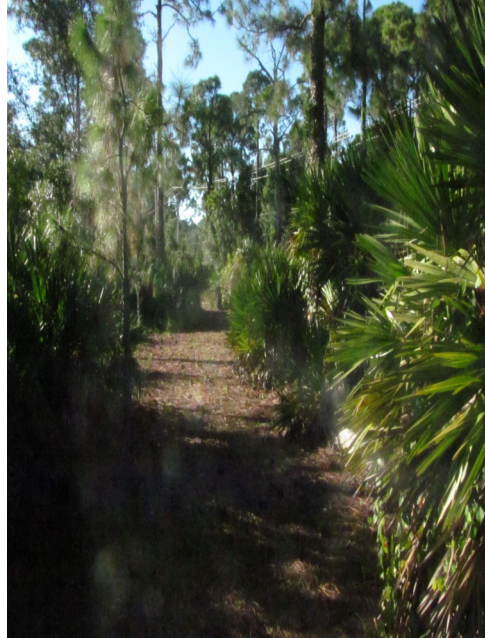
Woodland Buffer-Zone Trail

Meanwhile, extensive clearing was accomplished during October on the