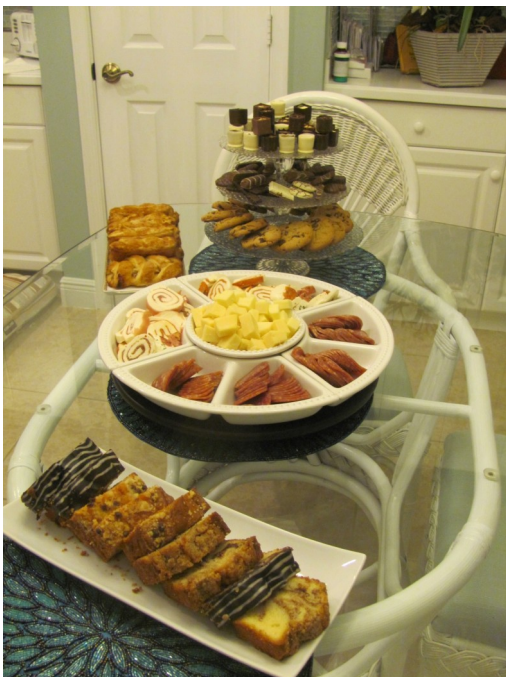
Sample Food Arrangement by Kathy Gambino

It is now a pleasant walk on which you might meet a grand old gopher tortoise, among other critters. Access this trail either at the NW corner of our property (behind Hyde Park) or the extreme NE end (north of the walk-in gate to the Linear Park), or from the circle at the north end of Avon Park. □