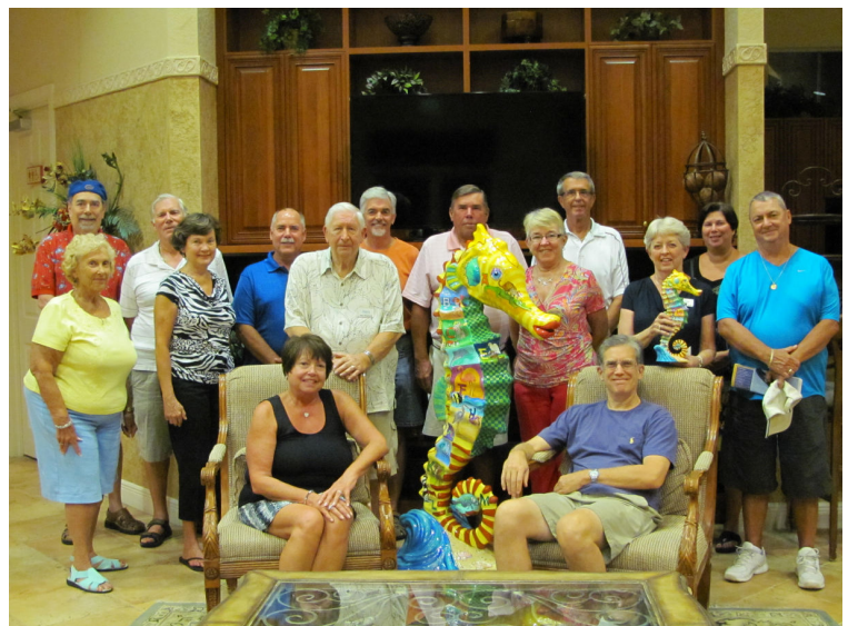
Our Seahorse Dream Committee