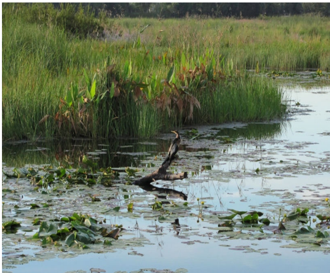
An anhinga enjoys the lily pond

A small trailer at the southern end of the marsh contains a pilot program for removing organic nitrogen—one of the worst elements of urban water pollution—by pumping surface water through a commercial ultra-violet reactor followed by several filters and an optional hydrogen peroxide injection system. If it is successful, similar projects may be built around Florida on a larger scale. □