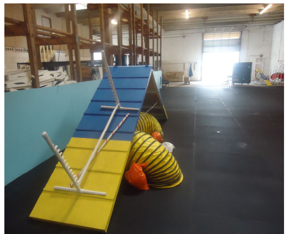
Dog exercise ramp