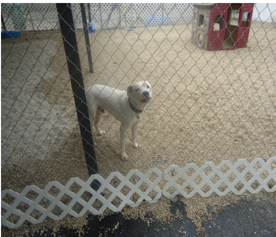
Looking for playmates

K-Nine believes that dog obedience training can be accomplished with a variety of different dog training techniques and class styles. These techniques can range from puppy house training, dog housebreaking tips, and dog behavioral modification, to protection-dog training and anything in between. Class styles include private, group class, in-home and semi-private classes. Regardless which of their techniques you choose, you and your pet companion will learn from each other trust, respect and mutual admiration. □