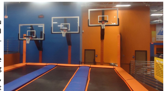
Sky Slam Courts

Sky Zone gives new meaning to going to a "sock hop." □