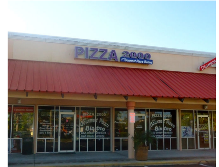
A.K.A: "Gourmet Pizza Bistro"

Open Monday-Thursday from 11:30 am-10 pm, Friday and Saturday from 11:30 am-11:00 pm and Sunday from 4:00 pm-9:00 pm, they offer free delivery with a $15 minimum order. If you haven't already been there, you should give them a try! □