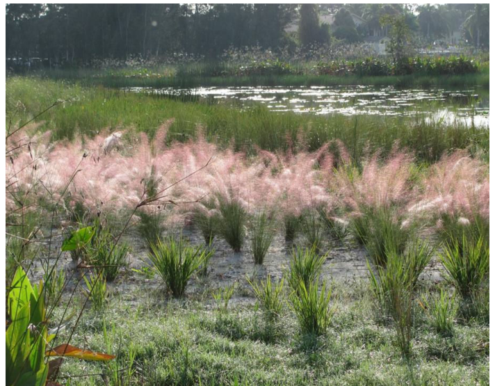
Muhly-grass and other new plantings