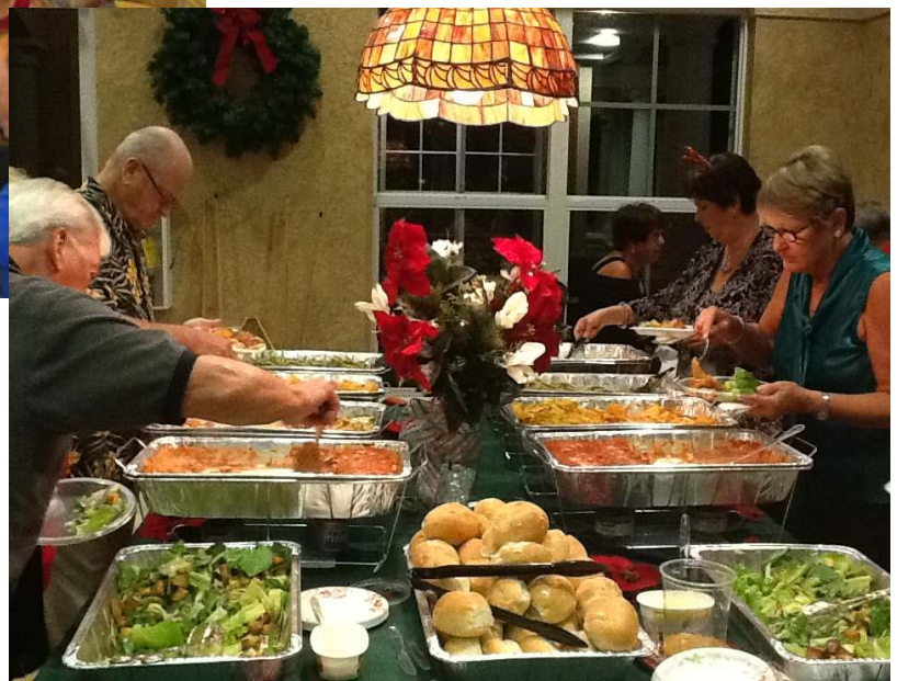
Grand Italian buffet