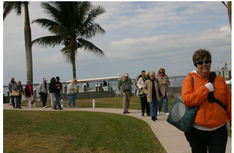
Disembarking at Tarpon Lodge