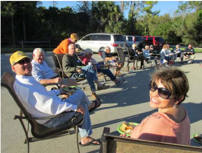
Courtyard II— good friends

Plans are already afoot for next year's party! □