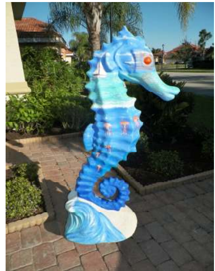
MS BELLE, nearing completion