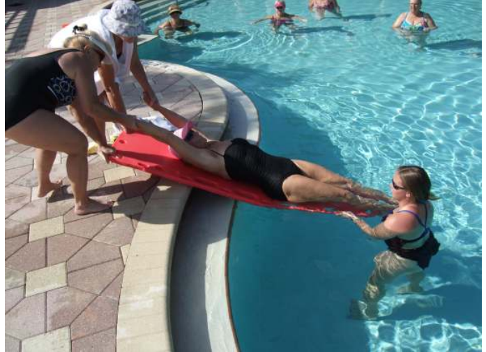
BTP pool rescue training.

Finally, all residents should be aware of the location of the three 911 call boxes on our property. One is located on both pool decks and in the exercise room. Bringing a back-up cellular phone to these areas is also recommended. Remember, when a hazardous event may be unfolding, call 911 right away. Each one-minute delay in obtaining proper help decreases the chances of survival for a non-breathing victim by 10%. [NOTE: our call boxes have recently been out of service when the phone lines were accidentally cut. When possible, residents should bring cell phones as a secondary 911 contact device.] □