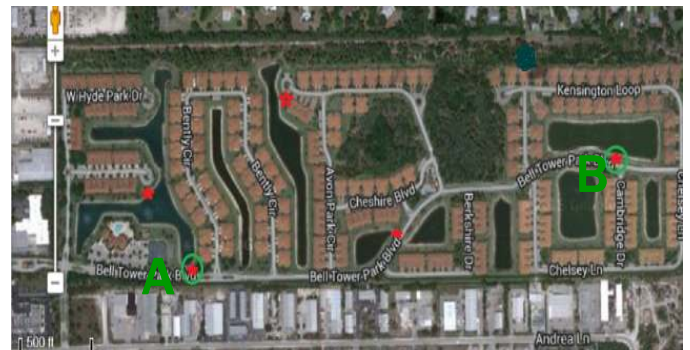
Donated bench locations

The benches cost $725 installed and may be designated in honor of a person or group as well as in memory. For details on how to give a bench, contact our CAM Office (239-454-4605). □