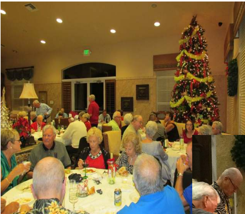
An evening of enjoyment