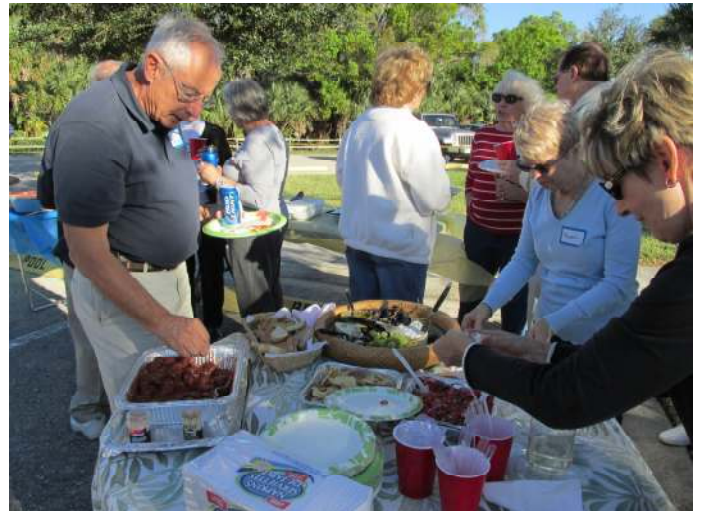
Courtyard II— good food