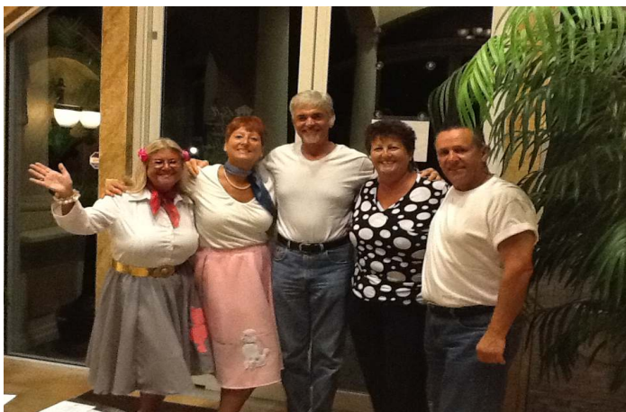
Ready to Rock and Roll