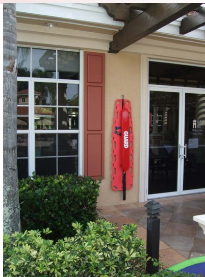
Pool safety equipment (main pool)

A special thanks go out to the men and women of our South Trail Fire Department who have provided us with training and advice on the purchasing and positioning of our safety equipment, and who stand ready to help us in emergency situations. □