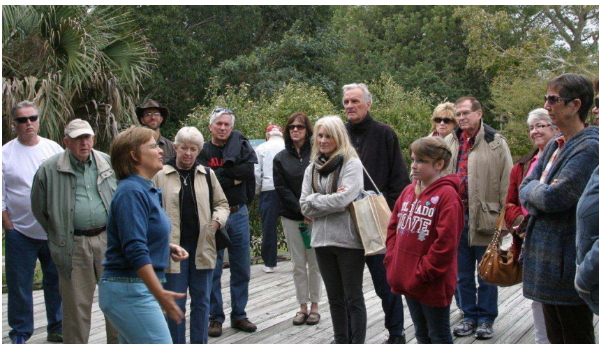
At Randell Research Center