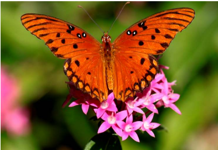
Gulf Fritillary Butterfly