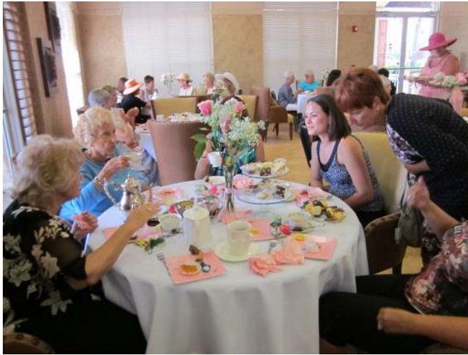
Guests enjoy the afternoon