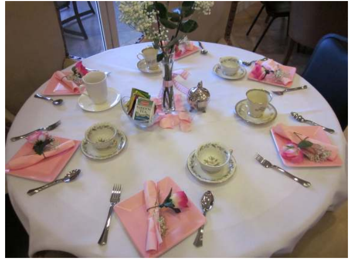
An elegant setting