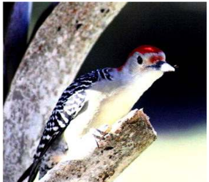
Red Bellied Woodpecker