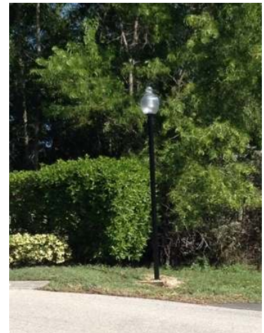
Andrea Ln. Pole light