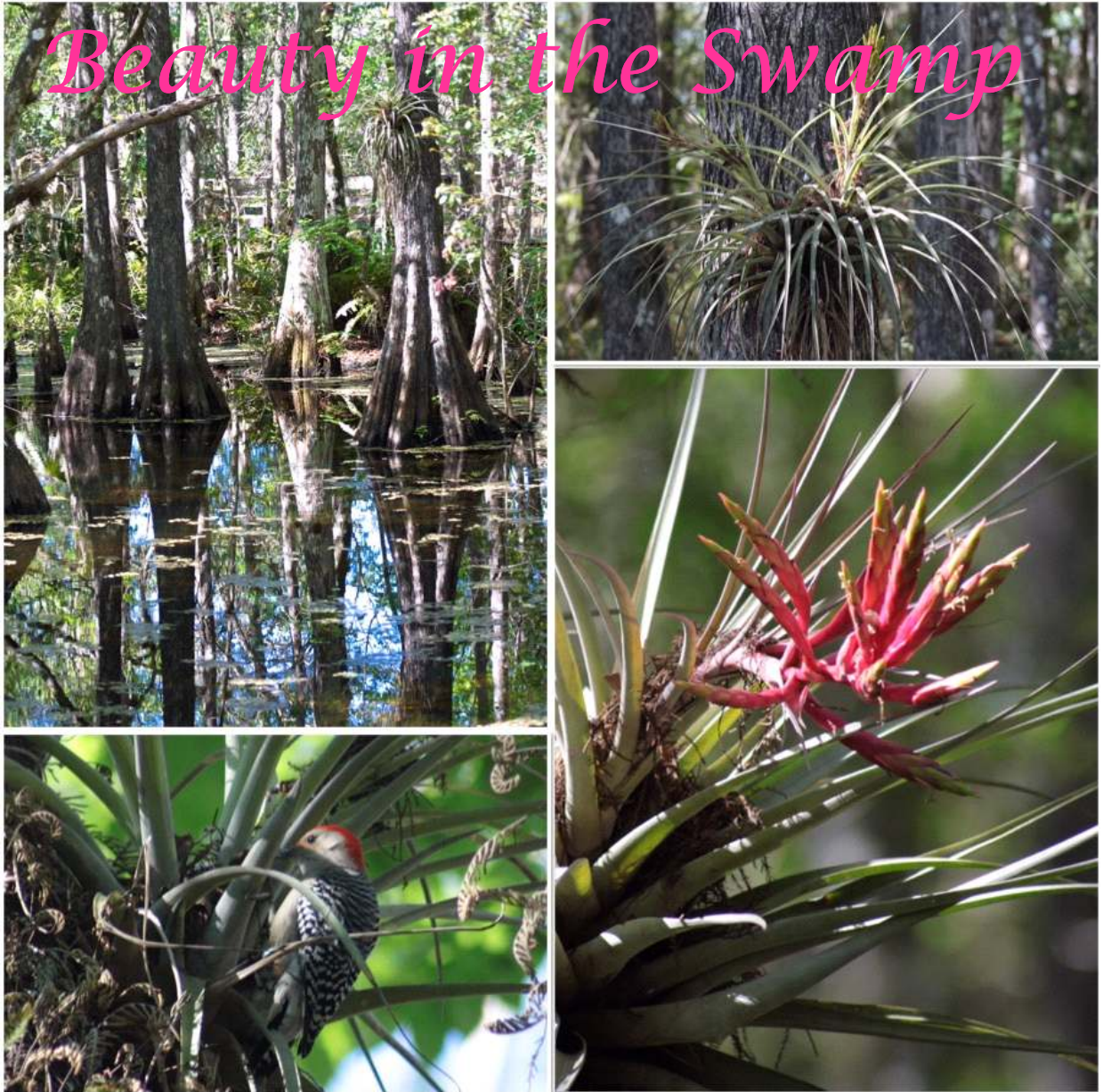
Clockwise, from upper right: Bromeliad on tree, Cardinal Bromeliad, Red-Bellied Woodpecker, Bald Cypress trees.

One of our nearby treasures is Six-Mile Cypress Slough Preserve, at 7751 Penzance Blvd, Fort Myers, FL 33912. Open 8 a.m. to sunset daily, the Slough has an education center and offers free guided walks at 9:30 a.m. on Wednesdays throughout the summer. Visit http://www.sloughpreserve.org .