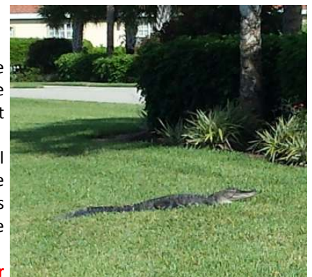
Gator near BTP Blvd.