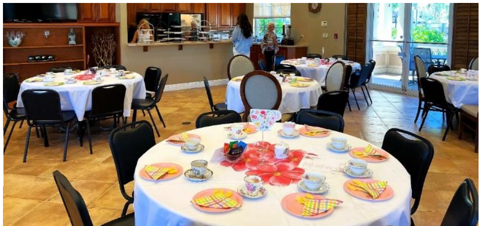
Preparing the tea/lunch setup!