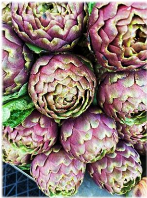
I was fortunate enough to arrive for the Spring artichoke season. Delizioso!

Perugia has its own airport and there are many flights within Europe, especially during the summer. One can also easily access Perugia by train from Rome or Florence.