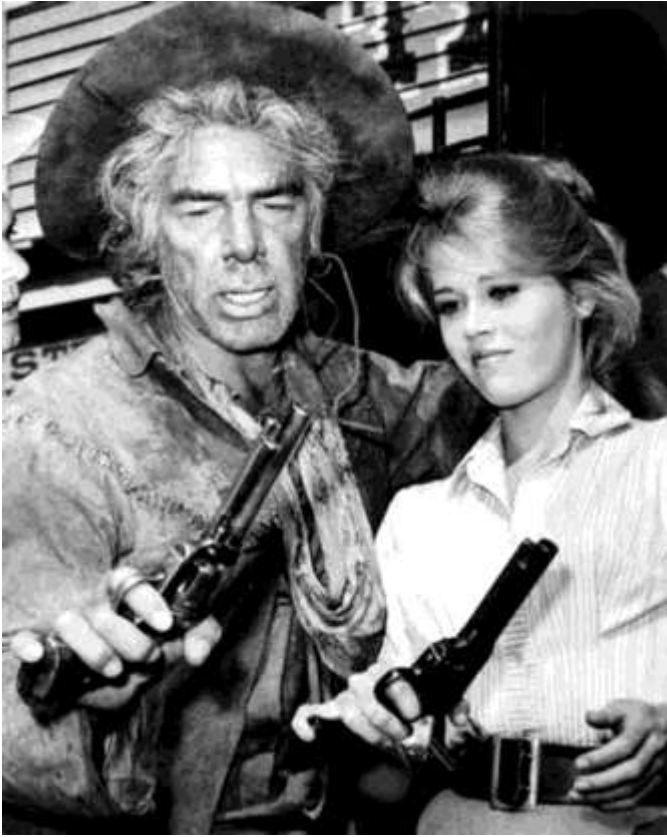
Best Actor Oscar winner Lee Marvin trades gun-handling tips with co-star, Jane Fonda.

As the clock struck 6:30 P.M., the lights dimmed, the sun set, and the audience settled into their seats. The large screen flickered to life, and the opening credits of "Cat Ballou" rolled. Subtitles were provided, accommodating all viewers and enhancing the enjoyment of the film. The laughter and cheers that punctuated the screening were a testament to the film's enduring appeal and the audience's engagement.